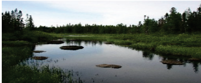
Minnesota's Arrowhead Region Under Threat