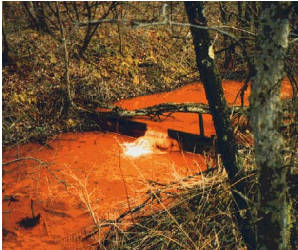
Acid Mine Drainage (Penn. DEP)

Sulfide ores are ores containing heavy metals (such as copper or nickel) that are bonded to sulfur, forming sulfide minerals. When exposed to air and moisture, a chemical reaction generates sulfuric acid that can leach into the surrounding environment and cause the release of the metals into streams and lakes at levels that are toxic to fish and other aquatic life. This phenomenon is known as Acid Mine Drainage .