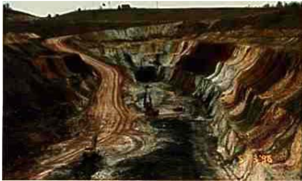
Flambeau Mine near Ladysmith, WI

Acid mine drainage has already polluted more than 12,000 miles of rivers and streams and over 180,000 acres of lakes and impoundments in the United States. According to the U.S. EPA, acid mine drainage from coal mining is the leading source of water pollution in the Mid-Atlantic States. Acid Mine Drainage from metal mines in Western states has caused some of the country's largest and most contaminated Superfund sites. Mining companies argue that modern mining methods can protect against Acid Mine Drainage, but they cannot point to a single mine that is more than a few years old that has not resulted in contamination. Because Acid Mine Drainage often takes several years to develop, recent mines that have not yet contaminated nearby waters do not provide proof that these ores can be mined safely.