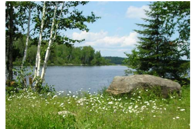
Birch Lake, NE of Babbitt, MN

The PolyMet mine is just one of many proposed new mines, mine expansions, and new industrial plants in Northeastern Minnesota. These facilities, some of which have already been permitted, will destroy thousands of acres of wetlands and wildlife habitat, substantially increase air emissions (including mercury and acid and haze-forming pollutants), and further degrade some of the area's streams and rivers. The State's current administration has given these facilities priority, explicitly fast-tracking their permit processes. Franconia Minerals is proposing to mine a sulfide ore body that lies partially underneath Birch Lake.