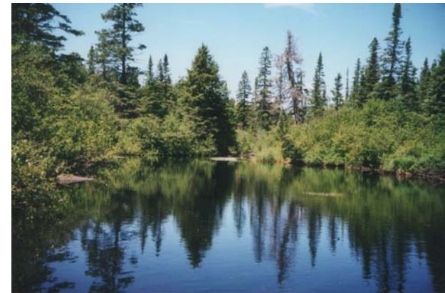
Areas in and near the BWCAW will be affected

Located between the North Shore of Lake Superior and the Boundary Waters Canoe Area Wilderness, the Arrowhead Region is Minnesota's most loved recreation area and a place that millions visit for rejuvenation. This region faces an unprecedented industrial expansion that is certain to affect the qualities that draw people here.