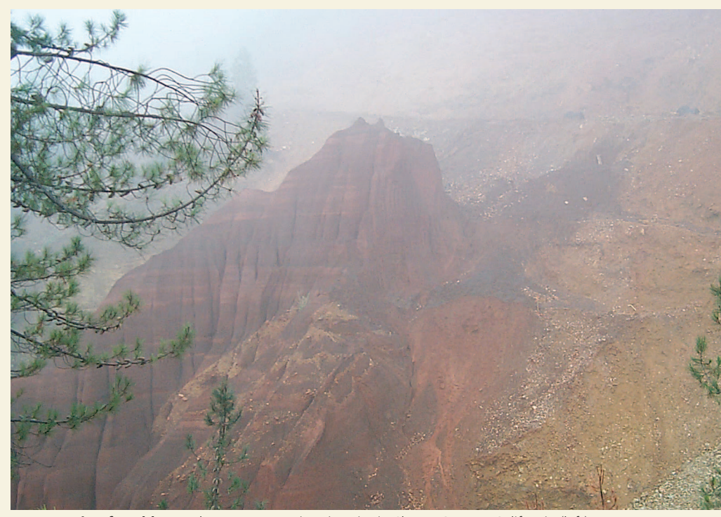
A mountain of problems. The Iron Mountain mine site in Shasta County, California (left), once a site of gold, copper, and zinc mining, encompasses 4,400 acres. The Minnesota Flats treatment plant (right top) was built in 1994 to treat AMD from the site. Drainage from the site's Richmond mine collects in a pool (right bottom).

When a company abandons a mine site but stays in business, lawsuits can be brought by government agencies, individuals, and nonprofit groups to remediate the environmental damage. In California in 2000, Aventis Crop Sciences USA, then a