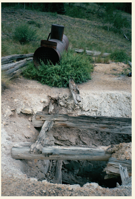
Lying in wait. Old mines present structural hazards such as the danger of collapse or accidental falls.

Mine shafts and tunnels can cause problems far from the mine opening as well. In coal mines especially, since they are worked closer to the surface than hardrock mines, mine workings can collapse, engulfing vehicles, buildings, and people. In coal country, such as Ohio, West Virginia, and Pennsylvania, it's not unusual for sinkholes to develop under new construction projects and on occasion existing structures as well, says