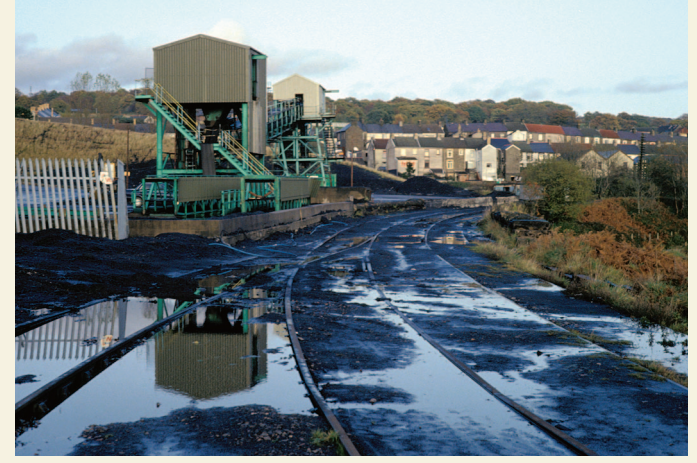
Closed but no closure. The bulldozed Treharris coal mine in southern Wales remains an eyesore and potential hazard to the residents nearby.

Conversely, hardrock mine waste rock, tailings, displaced surface material ("overburden"), and other rock surrounding an abandoned hardrock mine can contain up to 50%